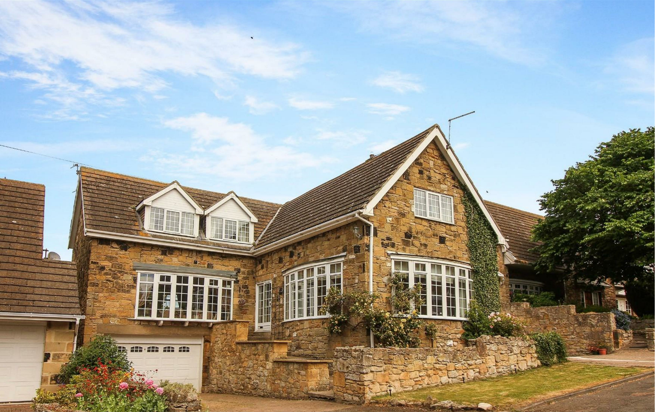
📍 Garth Lane, Morpeth NE61 5EN